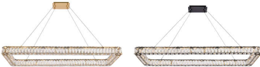
Satin Gold Item No:3504D50L1G